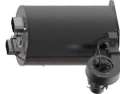
6820008TU DHD SERIES HEATER ASSY