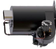
1360008TU DHA SERIES HEATER ASSY

Engine DC12V Recharging To charging the battery and for ignition and temp. controller usage.