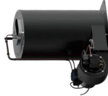
2390008TU DHB SERIES HEATER ASSY