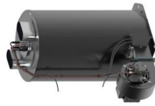
3750008TU DHC SERIES HEATER ASSY